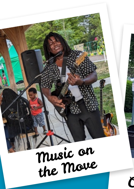
Music on the Move