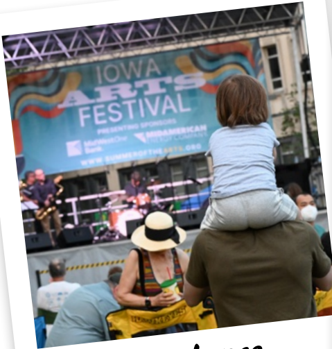
Attendance of nearly