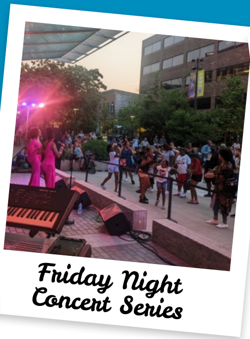
Friday Night Concert Series