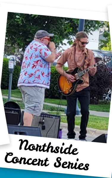
Northside Concert Series