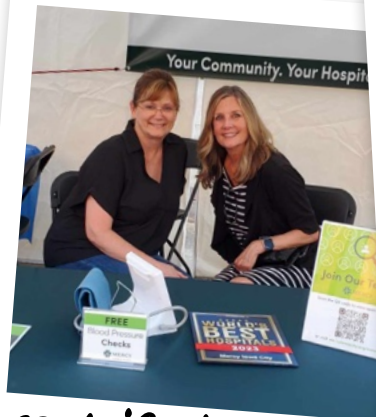
contributing over 2,500 hours