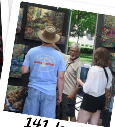
141 Iowa fine artists

For more information about our 2024 events visit: SummeroftheARTS.org