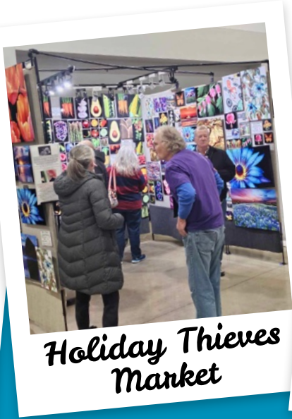
Holiday Thieves Market