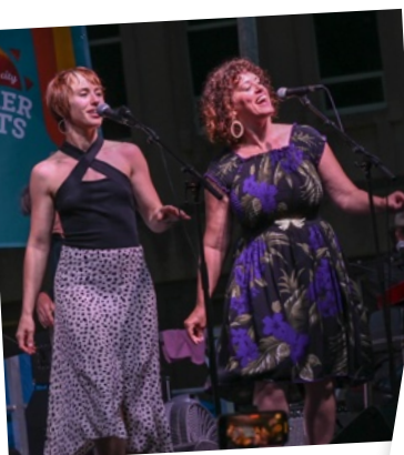
472 Iowa performers