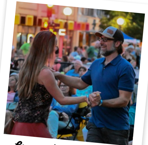
Brought together each year