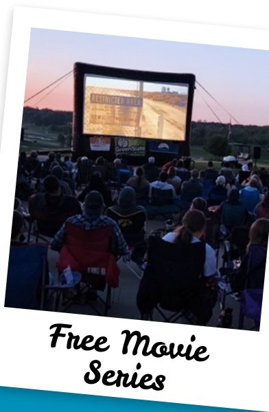
Free Movie Series

Your Support Helps Us Create a Community Full of Inspiration