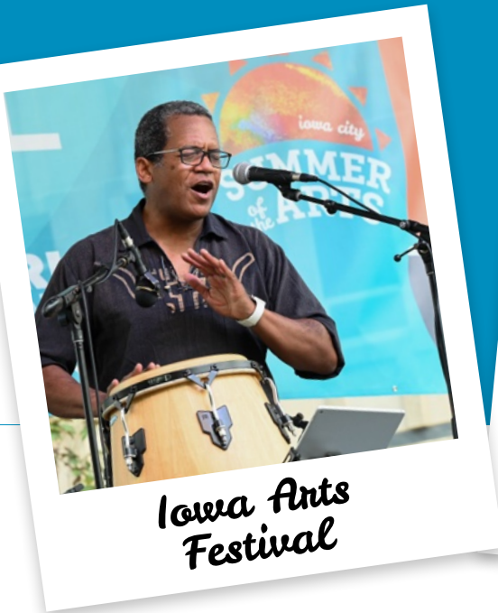
Iowa Arts Festival