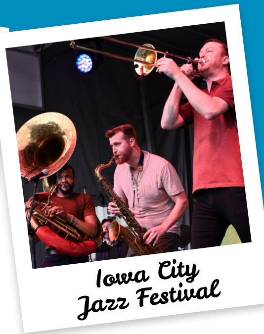
Iowa City Jazz Festival