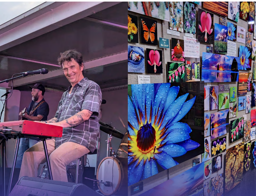
Rhythms at Riverfront Crossings