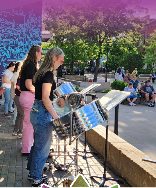
Friday Night Concert Series