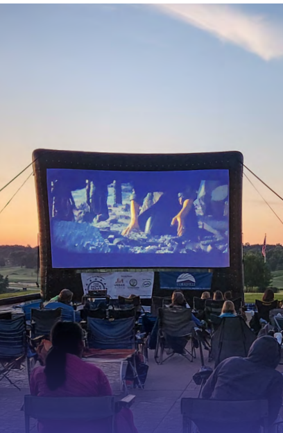
Free Movie Series