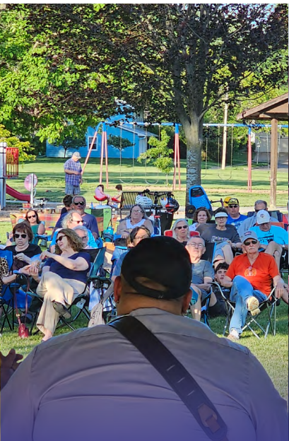
Music on the Move