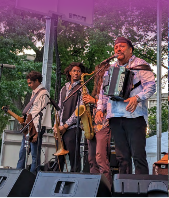
Iowa Arts Festival